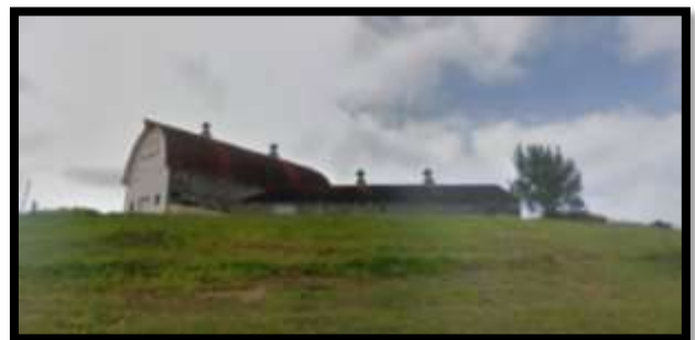
Dairy Barn