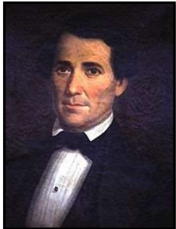
Governor James Madison Wells