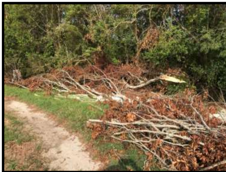
Historic Rapides Cemetery showing downed trees and limbs after Hurricane Laura. The City of Pineville has removed these since this photo was taken.