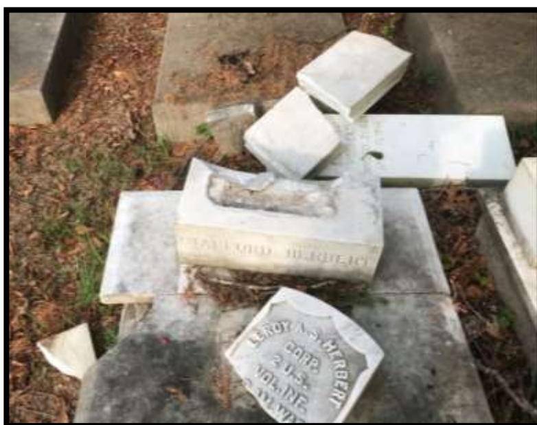
Damaged and dislodged monuments caused by downed trees during Hurricane Laura.